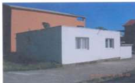
Slika 3, 5 i 6: stari objekat koji je goren