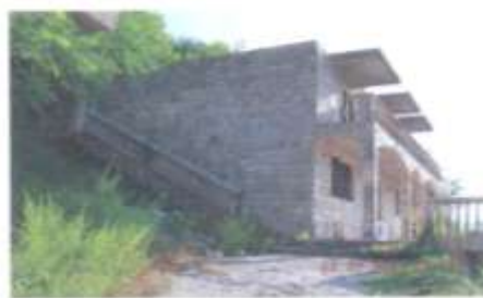
Slika 1 i 2: solidne nezavršene porodične kuće u Zelenici